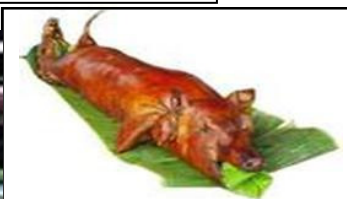
Lechon provided by the POKER BOYS